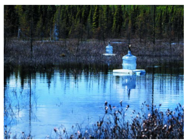
Figure 2. A static floating chamber deployed in the backwaters of the Experimental Lakes Area Reservoir Project reservoir. Fluxes of \mathrm{CO}_2 and \mathrm{CH}_4 from the surface of the reservoir are calculated by measuring the rate of buildup of these gases over time inside the chamber.

(e.g., Chan et al. 1998). However, other studies found that the thin boundary layer method underestimated the flux measured by chambers (Duchemin et al. 1999) and sulfur hexaflouride (SF<sub>6</sub>) loss, especially at low wind speeds (less than 2 m/sec; Cole and Caraco 1998). In practice, the methods chosen to determine fluxes from reservoirs to the atmosphere are dictated by local conditions at the sampling site. For example, flooded tree snags or backwater bays are sheltered conditions, favoring the use of chambers because of their low and variable wind speeds. Conversely, chambers are often difficult to deploy in open stretches of