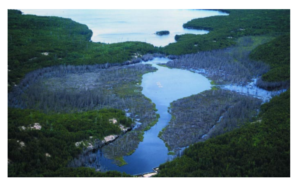
Figure 3. The Experimental Lakes Area Reservoir Project reservoir 4 years after experimentally flooding a wetland by raising the water level 1.2 m. The wetland before flooding consisted of a 2.3-ha central pond surrounded by a 14-ha peatland. Note that most of the inundated peat is now floating.

(1–73 years; Table 1). For these temperate reservoirs, we calculated average fluxes of 1400 mg \cdot m ^2 \cdot d of CO _2 and 20 mg \cdot m ^2 \cdot d of CH _4 (Table 1). Fewer data are available for reservoirs in tropical regions (Table 1). However, there appears to be an obvious difference between temperate and tropical reservoirs. CH _4 fluxes seem to be much higher relative to CO _2 fluxes in tropical reservoirs than they are in temperate ones.